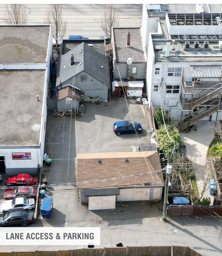
LANE ACCESS & PARKING